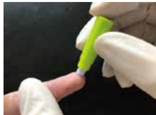
7 Push the sterile lancet firmly onto the chosen site.