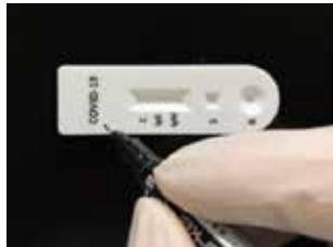
3 Open the test pouch and write the patient's ID on the test cassette.