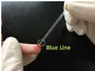
8 Use the disposable capillary to draw the whole blood up to the Fill Line.