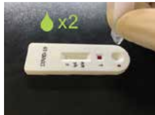
10 Add 2 drops of buffer.