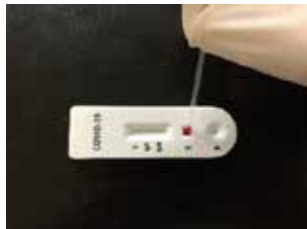
9 Transfer fingerstick whole blood specimen to the specimen well marked "S".