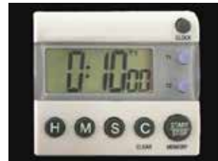
11 Read results at 10-20 minutes.