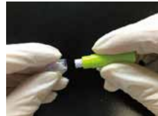
5 Carefully pull off the sterile lancet cap.