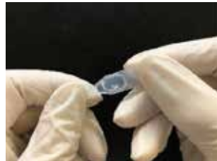
4 Twist off the tab of the buffer vial without squeezing.