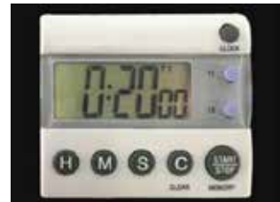
12 Do not read the results after 20 minutes. Reading too late can give false results.

! All the used tests, specimens and potentially contaminated materials should be discarded according to the local regulations.