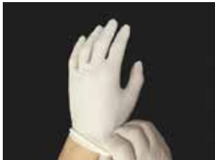
2 Put on the gloves. Use new gloves for each patient.