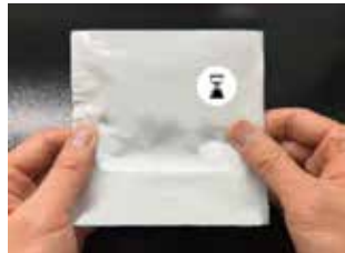
1 Check the expiry date. If expiry date has passed, use another kit.