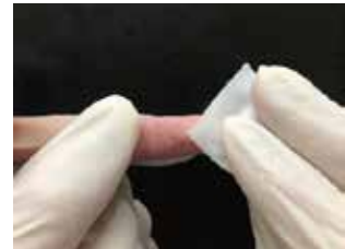
6 To disinfect the finger tip with alcohol swab.